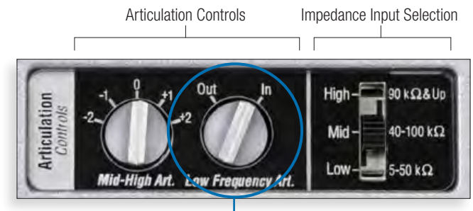
"In-Out" Low Frequency Articulation Switch

truly loves the performance, but the flaws in the recording are so great that the additional articulation works to exacerbate these flaws. In this instance, one would reasonably "dial down" the articulation knob.